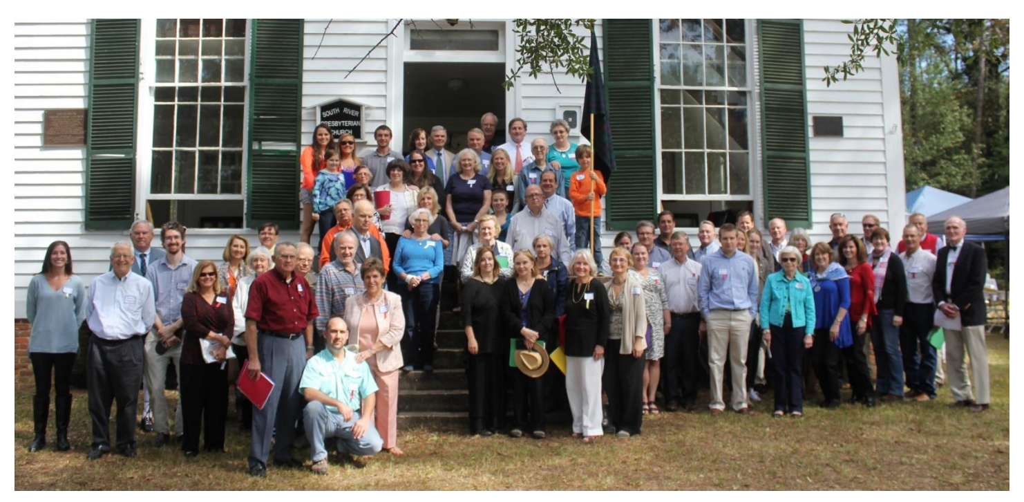
86th Cromartie Family Reunion, 1 Oct 2015

The South River Presbyterian Church Built in 1857