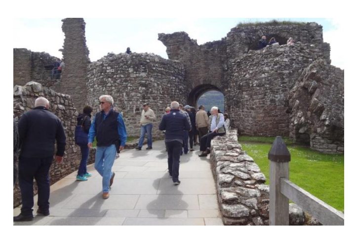
Urguhart Castle, crowded

But that was then... As we wandered through Cromarty's cozy streets, we struggled to uncover current connections.